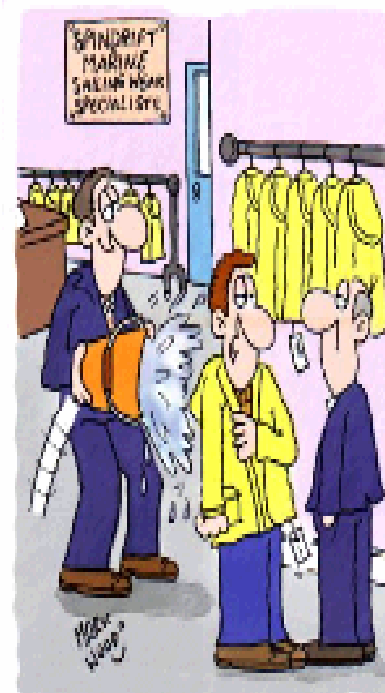
"It's very nice, but how do I know it really is waterproof?"

After the examination the optician said that my vision needed correction and asked me: 'What made you think you needed glasses?' I replied, without thinking: 'I'm having trouble picking up buoys after dark'.